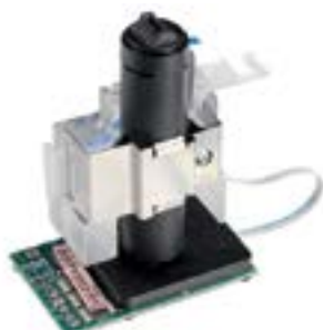
HP Optical Media Advance Sensor (OMAS)

HP Double Swath Technology provides breakthrough speed and performance. The HP Designjet Z6600 Production Printer includes two sets of three HP 771 and HP 773 Designjet Printheads, creating a wide print swath—up to 1.67 inches/42.5 mm—and a high firing frequency to deliver prints with amazing speed. Six bi-color printheads feature 1,056 nozzles per color, 1200 nozzles per inch, and small drop volumes for top photo quality.